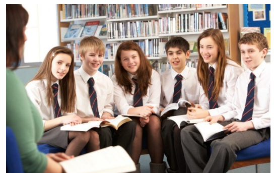
Social inequalities in entry to Higher Education are mostly explained by subject choice in Scotland.

Scotland and Ireland are similar in that they have comparable levels of social inequalities in education. Both countries have also seen expansion in the number of school pupils going into HE. However, Ireland and Scotland differ in the requirements for graduating from secondary education and entering HE. Unlike many European countries, Scotland